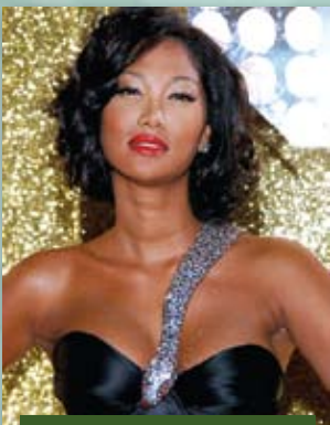
Kimora Lee Simmons